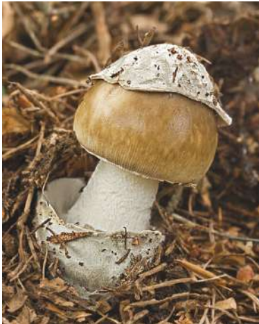
Emerging Grisette Pamela Jackson ARPS Circle 46