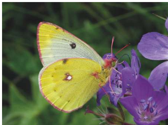
Male Mountain Clouded Yellow