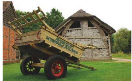
The Little Man Summer 2013

More information can be found on their website at www.avoncroft.org.uk