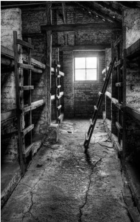
Women's Barracks, Birkenau

After brief development in an iron-based developer and fixing (traditionally in potassium cyanide, although modern ammonium thiosulphate fixers do the job) the plate is washed, dried and varnished. If the image is made on glass, the reverse is painted black to give a positive image.