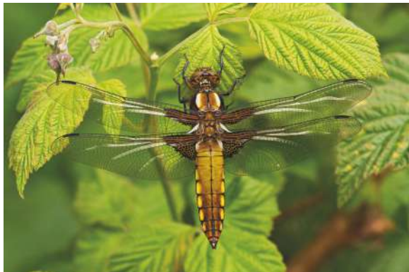
Broad-bodied Chaser Bob Crick Circle 45