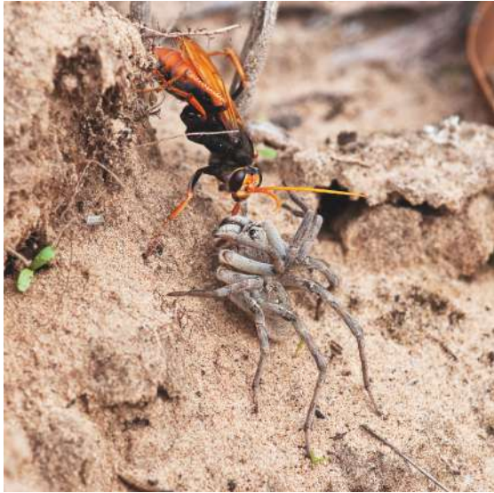
Wasp with Spider Prey