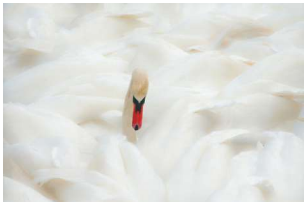
The Little Man Summer 2013