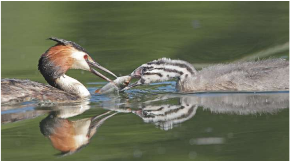
Great Crested Grebe feeding Chick